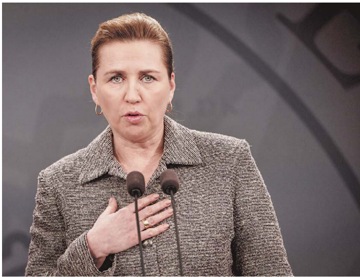
Danish Prime Minister Mette Frederiksen speaks about the current situation in Greenland while in Copenhagen last week.

In a joint statement released Sunday, the eight countries – Britain, Denmark, Finland, France, Germany, the Netherlands, Norway and Sweden – hit back and said that "tariff threats undermine transatlantic relations and risk a dangerous downward spiral."