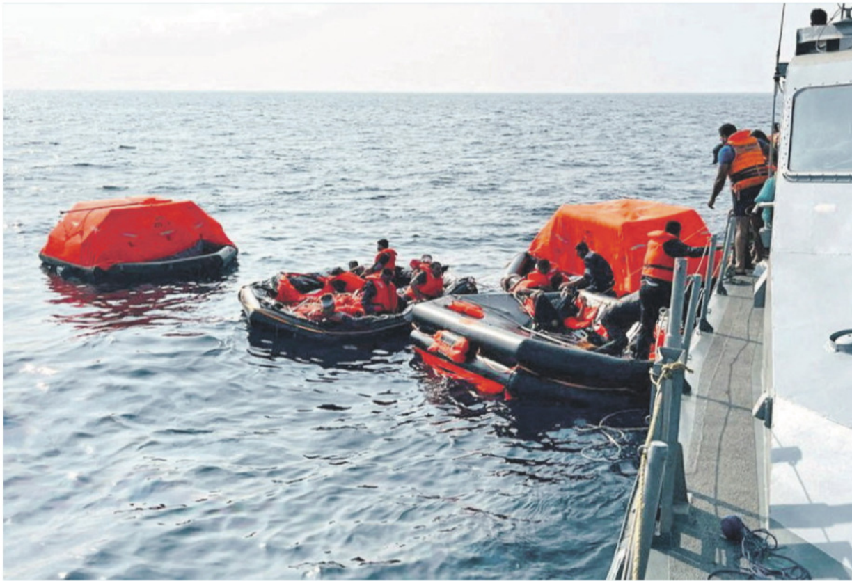
◀ Sri Lankan navy personnel rescue Iranian sailors after the sinking of IRIS Dena on 4 March. The Iranian warship had been invited to the Indian Ocean by India