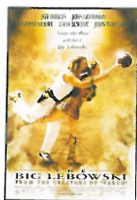
FAVOURITE ACTOR AND MOVIE Danish actress Ghita Nørby. I have many favourite films, of which one is The Big Lebowski by Joel and Elan Coen