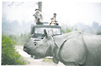
MOST MEMORABLE MOMENT IN INDIA Visiting the Taj Mahal and Kaziranga National Park