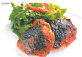
FAVOURITE INDIAN FOOD Tandoori chicken