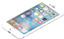
A GADGET I CANNOT LIVE WITHOUT My iPhone