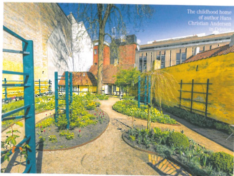
The childhood home of author Hans Christian Andersen in Odense